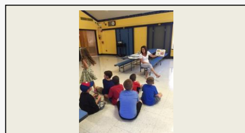
Reading at Miller Avenue Elementary