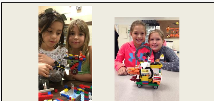
Building Legos at Joseph A. Edgar School