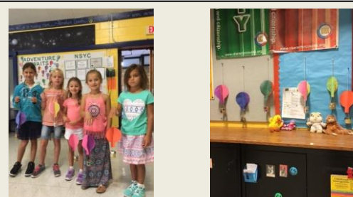
Crafting at Wading River Elementary